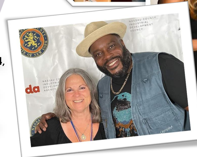
(top) Sal Rendino ( East NY, Billions ) presenting the Best Long Island Film Award.