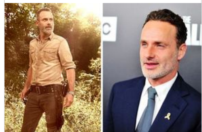
Andrew Lincoln net worth: How much is The Walking Dead star worth?