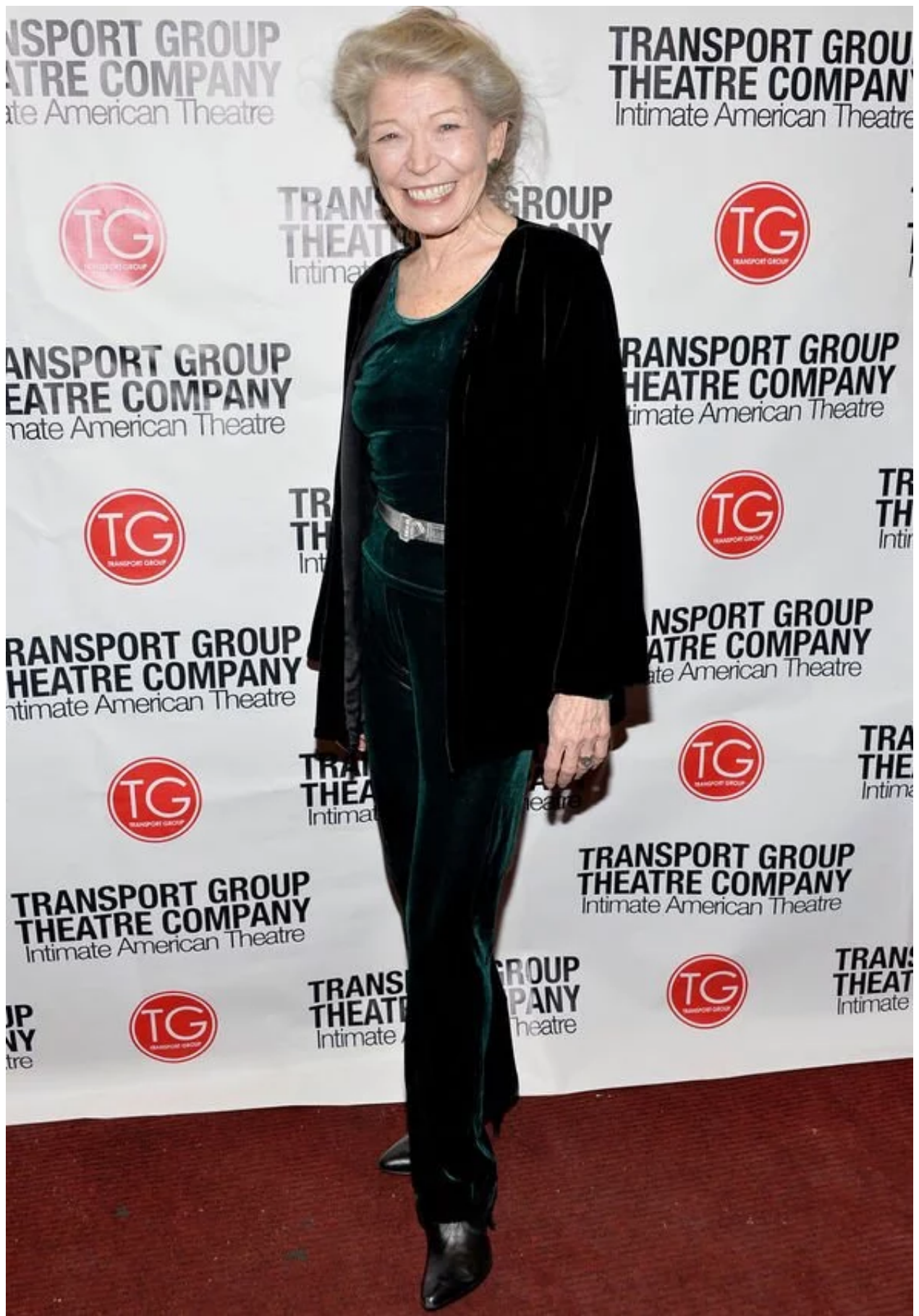
Phyllis Somerville dead: The actress died from natural causes at her home

Most recently, Phyllis appeared on Broadway in the original cast of Aaron Sorkin's 2018 adaptation of To Kill a Mockingbird .