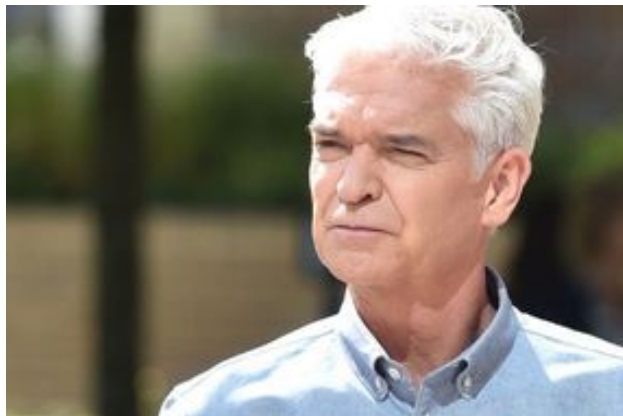
Phillip Schofield: This Morning host speaks out on 'very sad' time

(/celebrity-news/1310679/Phillip-Schofield-Instagram-pictures-dad-This-Morning-latest-news-update)