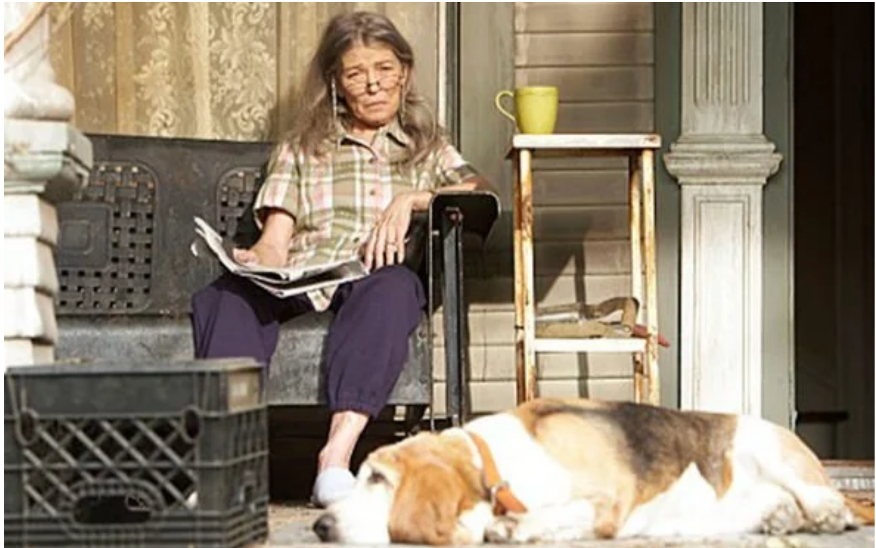
Phyllis Somerville dead: The actress played Marlene in The Big C