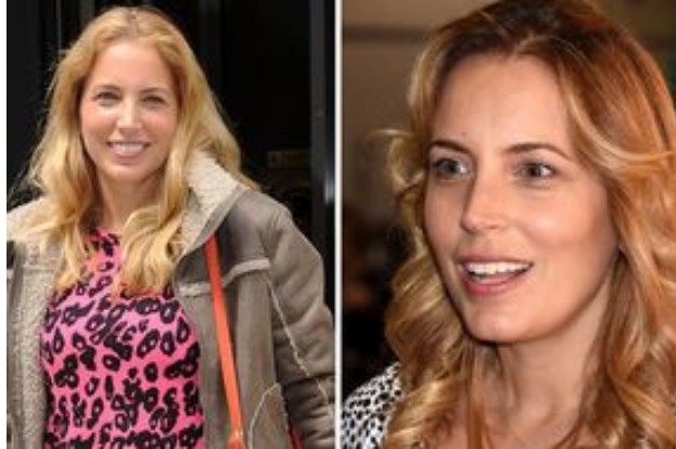
Jasmine Harman confirms big A Place In The Sun update

(/celebrity-news/1309838/asmine-Harman-A-place-in-the-sun-2020-presenters-episodes-update-news-latest)