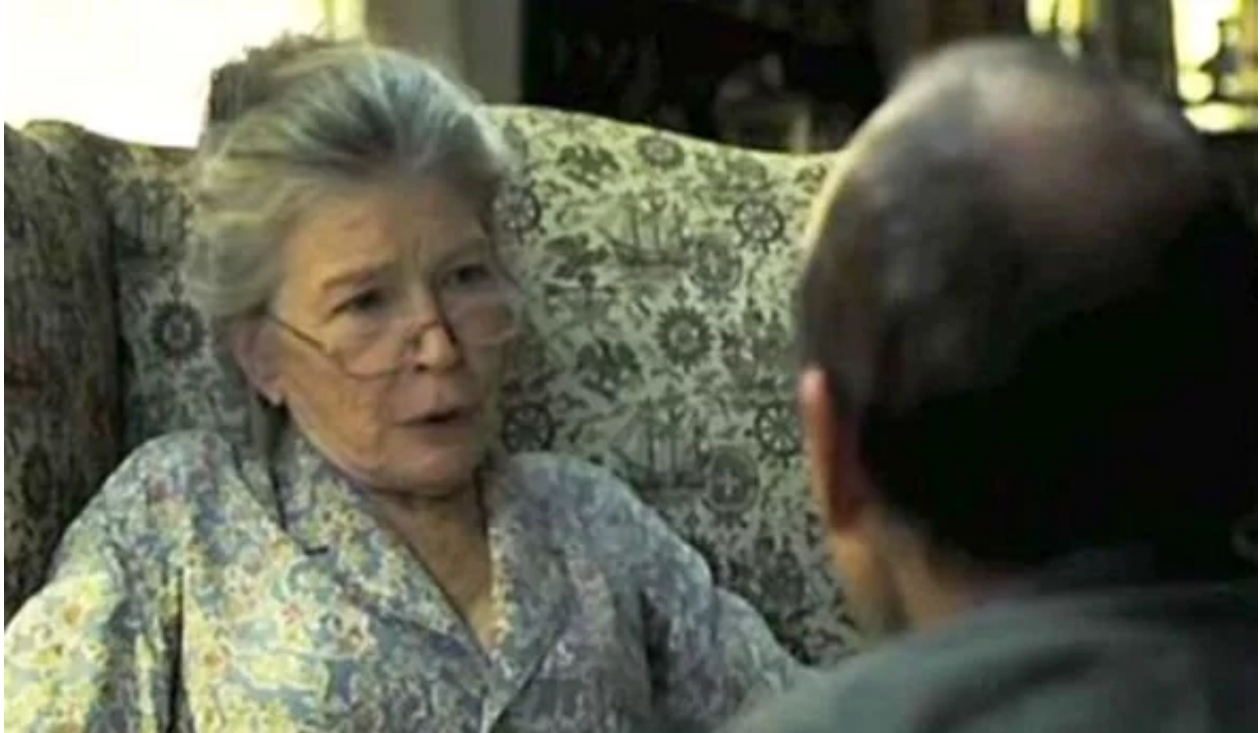
Phyllis Somerville dead: The actress as her character May McGorvey in the Little Children

(/celebrity-news/1310092/Kate-Garraway-husband-derek-draper-health-peter-andre-wife-emily-doctor-news-latest)