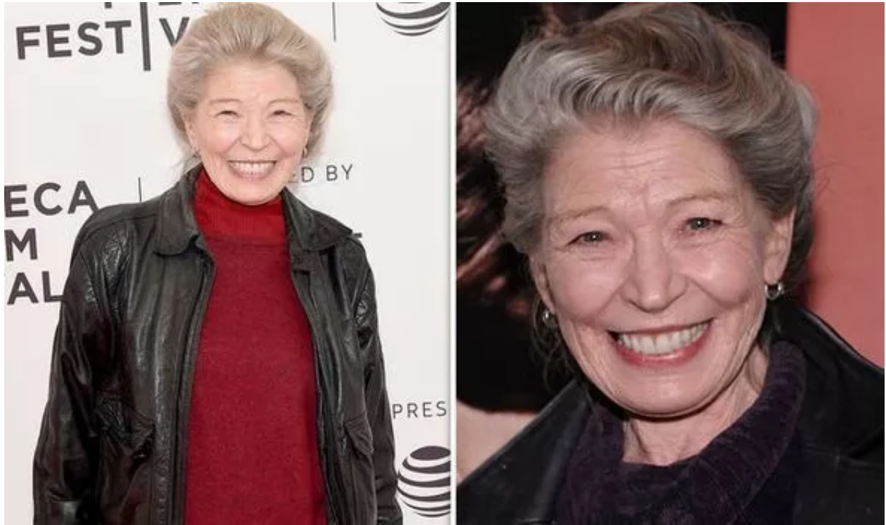
Phyllis Somerville has died aged 76

READ MORE: James Jordan inundated with support after heartbreaking news ((celebrity-news/1310555/James-Jordan-dad-health-tumour-instagram-family-news-latest))