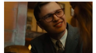
See Ansel Elgort, Nicole Kidman in GOLDFINCH