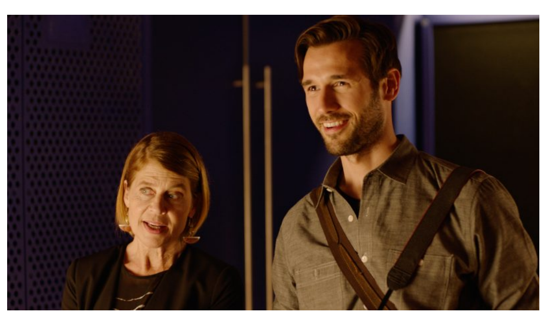
"Shoot Me Nicely" is being shown on July 19.